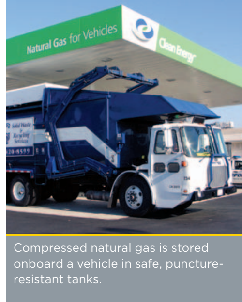
Compressed natural gas is stored onboard a vehicle in safe, puncture-resistant tanks.

the latest new vehicle offerings, also see the AFDC's light-duty and heavy-duty vehicle searches.